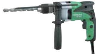
DV16V 16mm Impact Drill 06066712