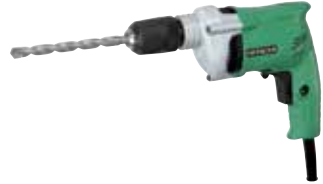
DV13VSS(HA) 13mm Impact Drill 09954323