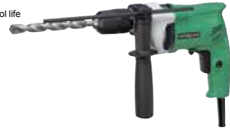
DV16VSS(HA) 16mm Impact Drill 09954340