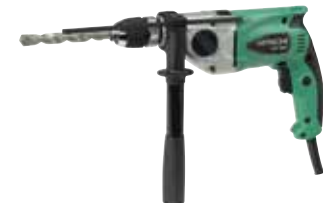
DV18V 18mm Impact Drill 06066729

CORROSION RESISTANT PNEUMATICS DRILLING ROOFING & DEMOLITION FASTENING GRINDING & CUTTING SANDING & POLISHING SAWING PLANTING & FLOTTING BLOWER HEAT GUNS & WET DRY VACUUMS HIGH PRESSURE WASHERS OUTDOOR POWER EQUIPMENT ACCESSORIES