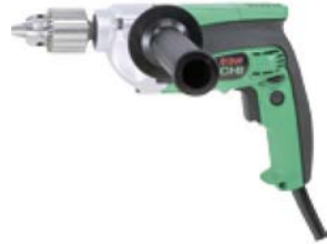
D13VF 13mm High Torque Drill 03490396