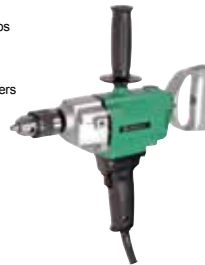
D13 13mm High Torque Drill 04513864