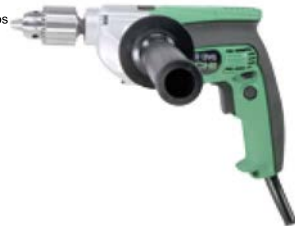
D13VG 13mm High Torque Drill 03490413